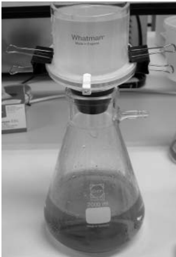
Fig. 1. Three-piece Glass Filter setup with the final wash of Paramecium in amoeba inorganic medium.

cultures, at log phase and with a minimum density of 4500 Paramecium /ml of culture medium, were used for inoculation of new cultures. Using aseptic techniques, 10-15% of the volume of medium to be inoculated was taken from the growing culture and transferred to the flask to be inoculated. The newly inoculated cultures were then grown in the dark at 26°C with no agitation or shaking needed.